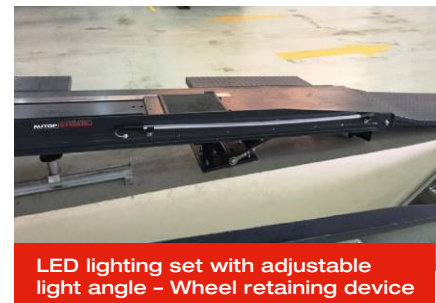
LED lighting set with adjustable light angle - Wheel retaining device