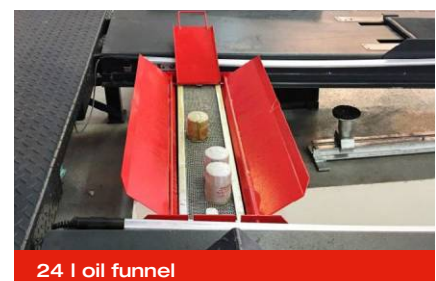
24 l oil funnel