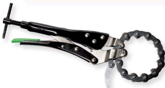
Adjustable self-locking cutting plier