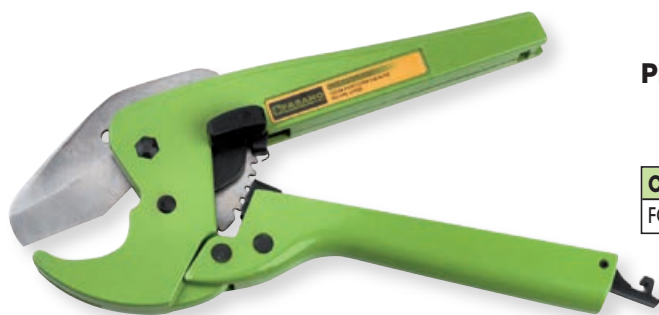
Pipe cutter for PVC tubes