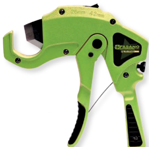
Pipe cutter for PVC tubes