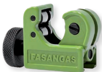
Mini tube cutter