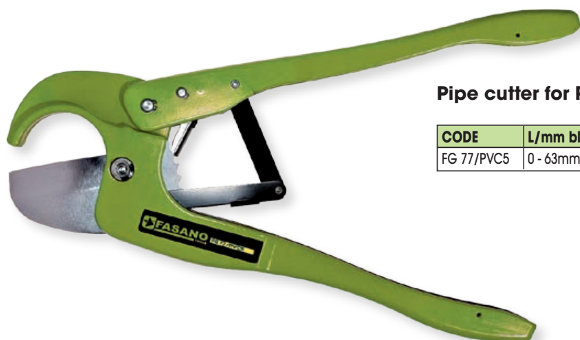
Pipe cutter for PVC tubes