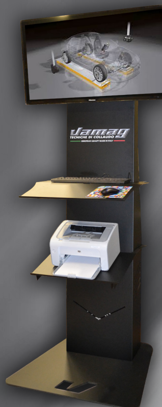
New Totem TTM with Pc, Printer and LED 42"

Total toe Partial toe Set-back Camber Thrust line Offset