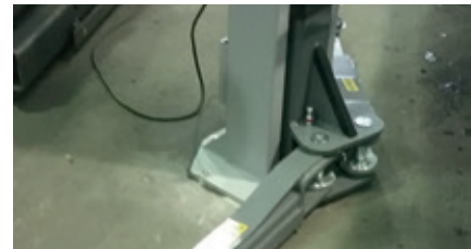
Swivel arm positioning > 180° for better drive-in situation