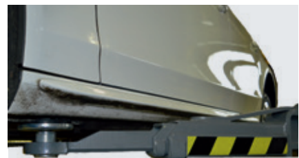
Low arm construction <100mm