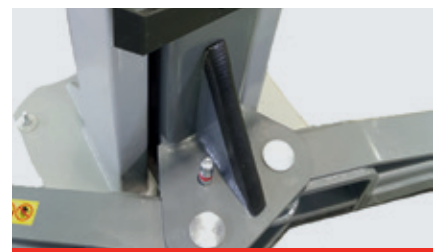
Arm locking system and door protection