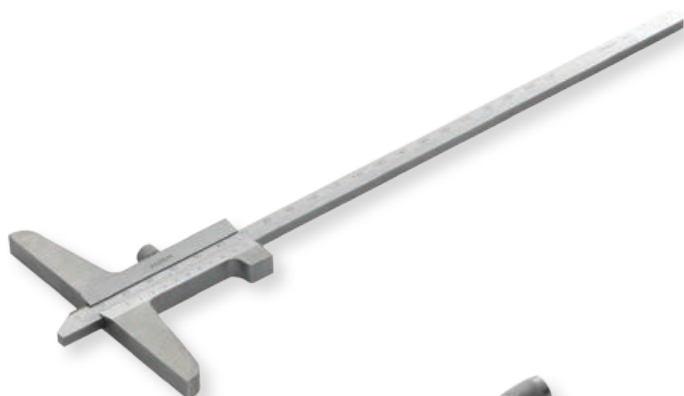
Professional depth caliper, reading to 0.02 Mm