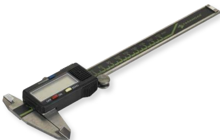
Professional digital caliper reading to 0.01 Mm