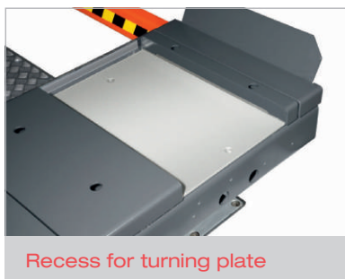
Recess for turning plate