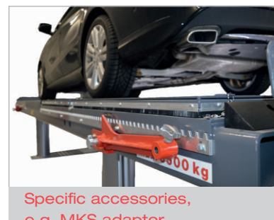
Specific accessories, e.g. MKS adaptor