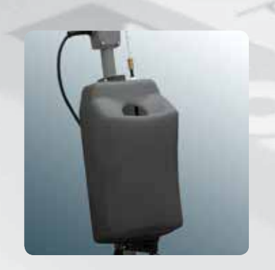
Accessories and brushes are not included. For available accessories refer to accessories pages.

• Code 0.955.0001K 11 l detergent tank (only for low speed models)