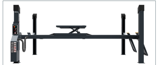
Wheel-free jack (load capacity 3.5 t) without wheel alignment kit