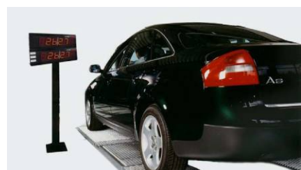
Testmaster PT440 S