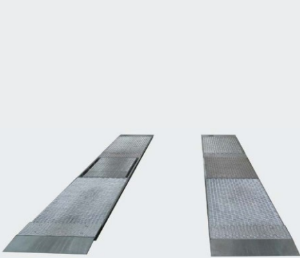
Plate brake tester