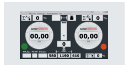
Basic Software Display