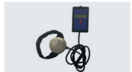
Pedal force meter