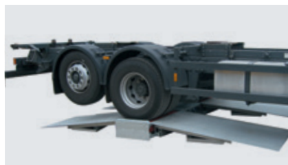
Drive-on /-off ramps